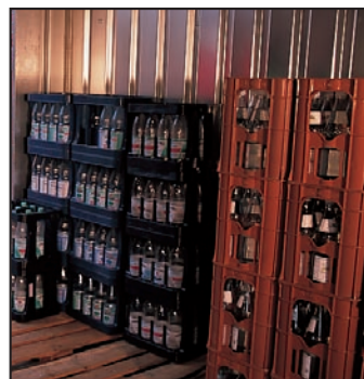
LC20 as a store room for drink crates and seating