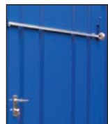
Anti-theft security bar