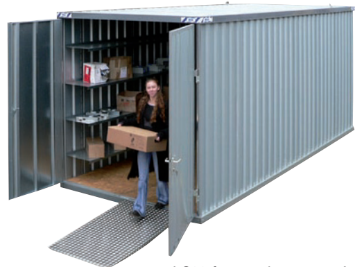
LC20 for goods or material storage