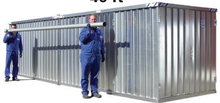
LC40 for extra-long storage goods such as sanitary and heating pipes or rods