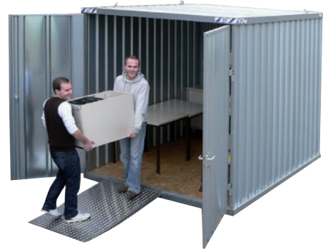
LC10 for furniture storage