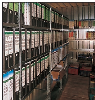
Industrial firm: LC40 for document storage